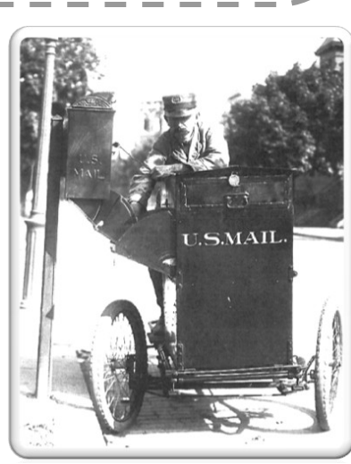
Photo from 1912 shows a motorized cart that was designed to receive mail from the boxes via a chute that dumped directly into the cart.

Your Branch Officers, Stewards, and Staff Wish You a Safe, Prosperous, Healthy, and Happy New Year!